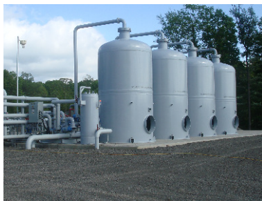
A Guild System for Landfill Gas

A high-BTU gas project is operating to provide pipeline gas from the City of Billings landfill. The state of the art facility is noted for the minimal process steps, elimination of pretreatment and the removal of N 2 contamination.