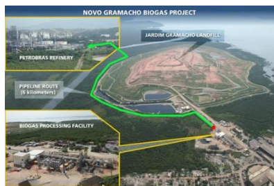
Landfill Gas to Pipeline Gas

One of the world's largest high-BTU landfill gas projects is now operating to compress and clean landfill gas from the Novo Gramacho landfill outside of Rio de Janeiro and provides pipeline quality gas while displacing purchased natural gas.