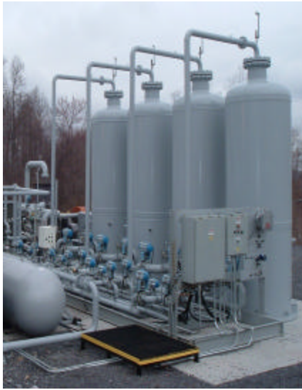
Molecular Gate ® Unit

Nitrogen rejection and carbon dioxide removal using the Molecular Gate ® adsorbent-based technology is gaining widespread acceptance in the natural gas industry. With two-dozen projects underway, the economic and easily operated system is allowing natural gas producers to develop contaminated fields with a simple technology that operates unattended with only a daily visit by the well pumper. Unlike other technologies, the system removes N 2 and CO 2 in a single step and provides high on-stream factors with minimal operator attention.